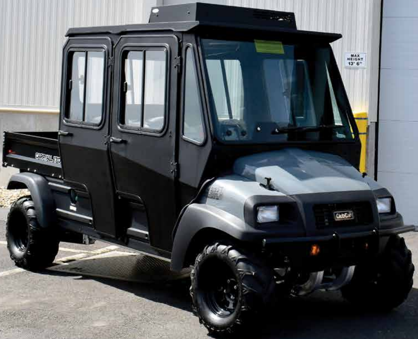
Curtis Cab with Air Conditioning on Club Car Carryall 1700