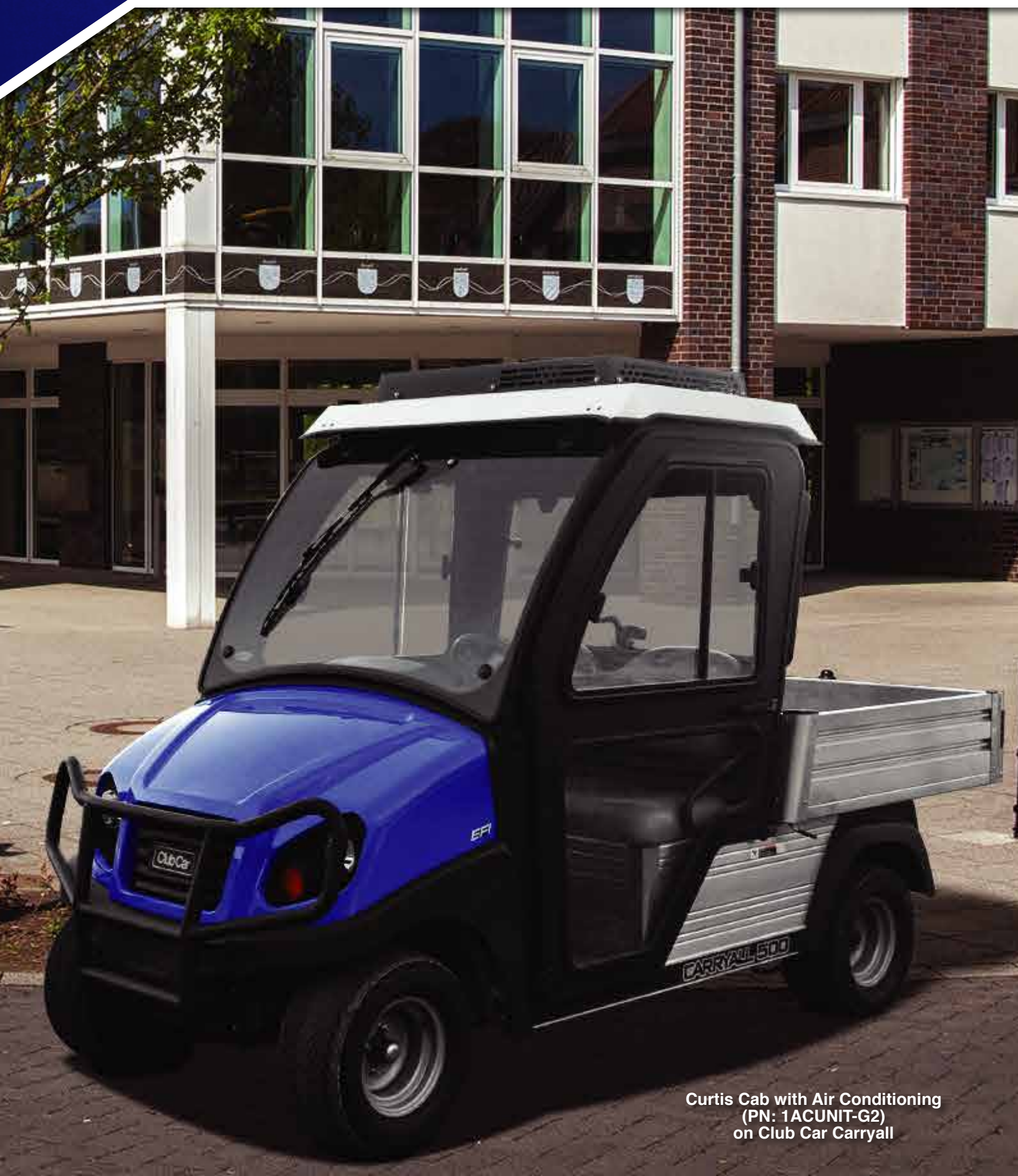
Curtis Cab with Air Conditioning (PN: 1ACUNIT-G2) on Club Car Carryall