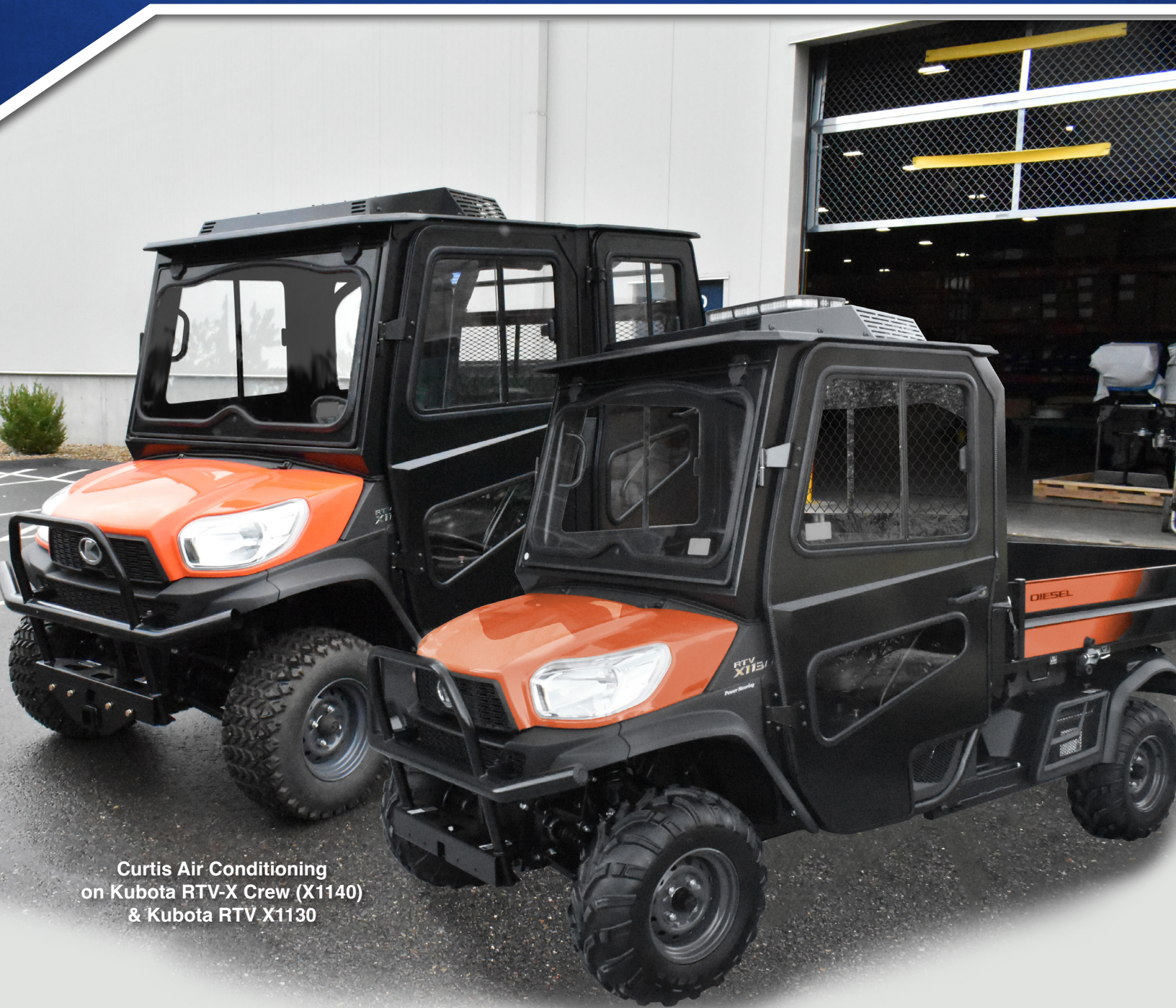
Curtis Air Conditioning on Kubota RTV-X Crew (X1140) & Kubota RTV X1130