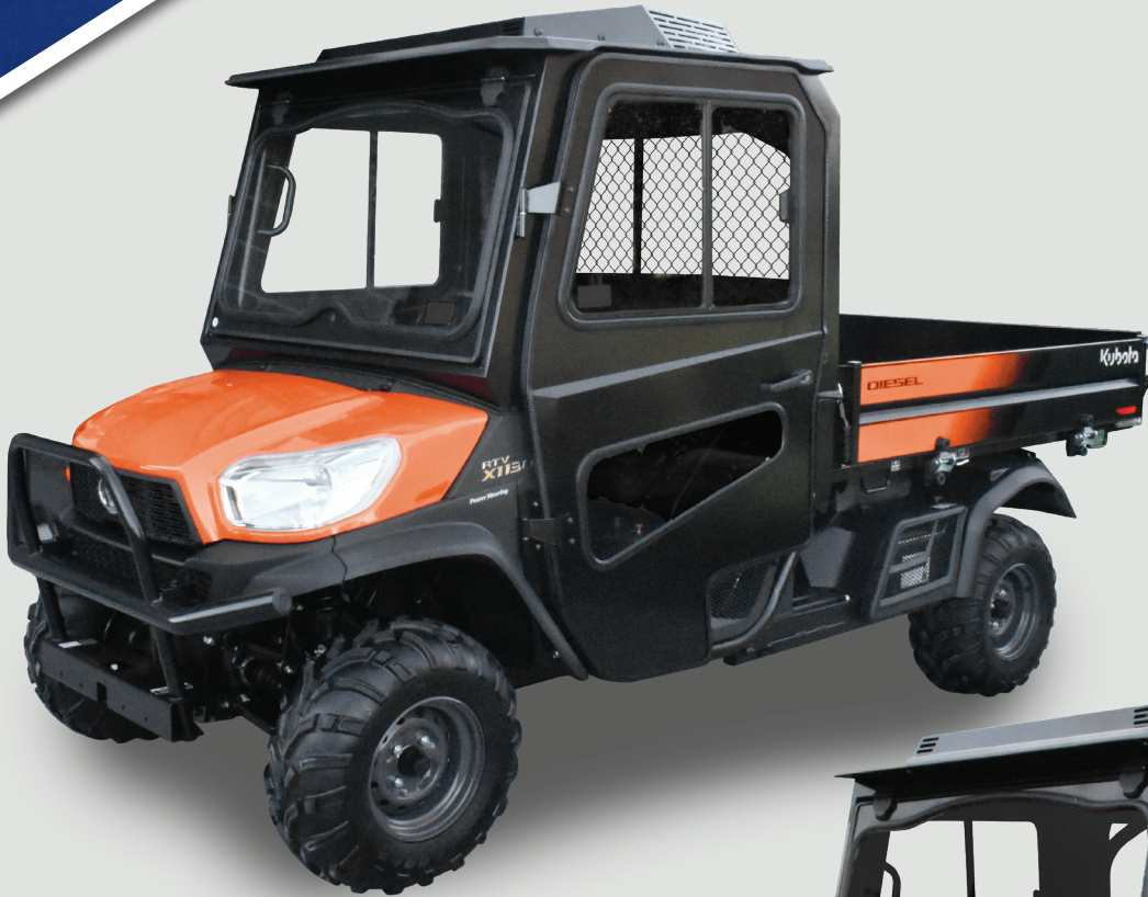
Curtis Air Conditioning on Kubota RTV-X Crew (X1140) & Kubota RTV X1130