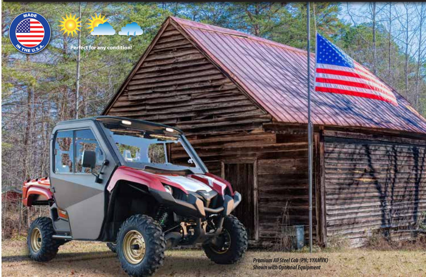
Premium All Steel Cab (PN: 1YAMVK) Shown with Optional Equipment