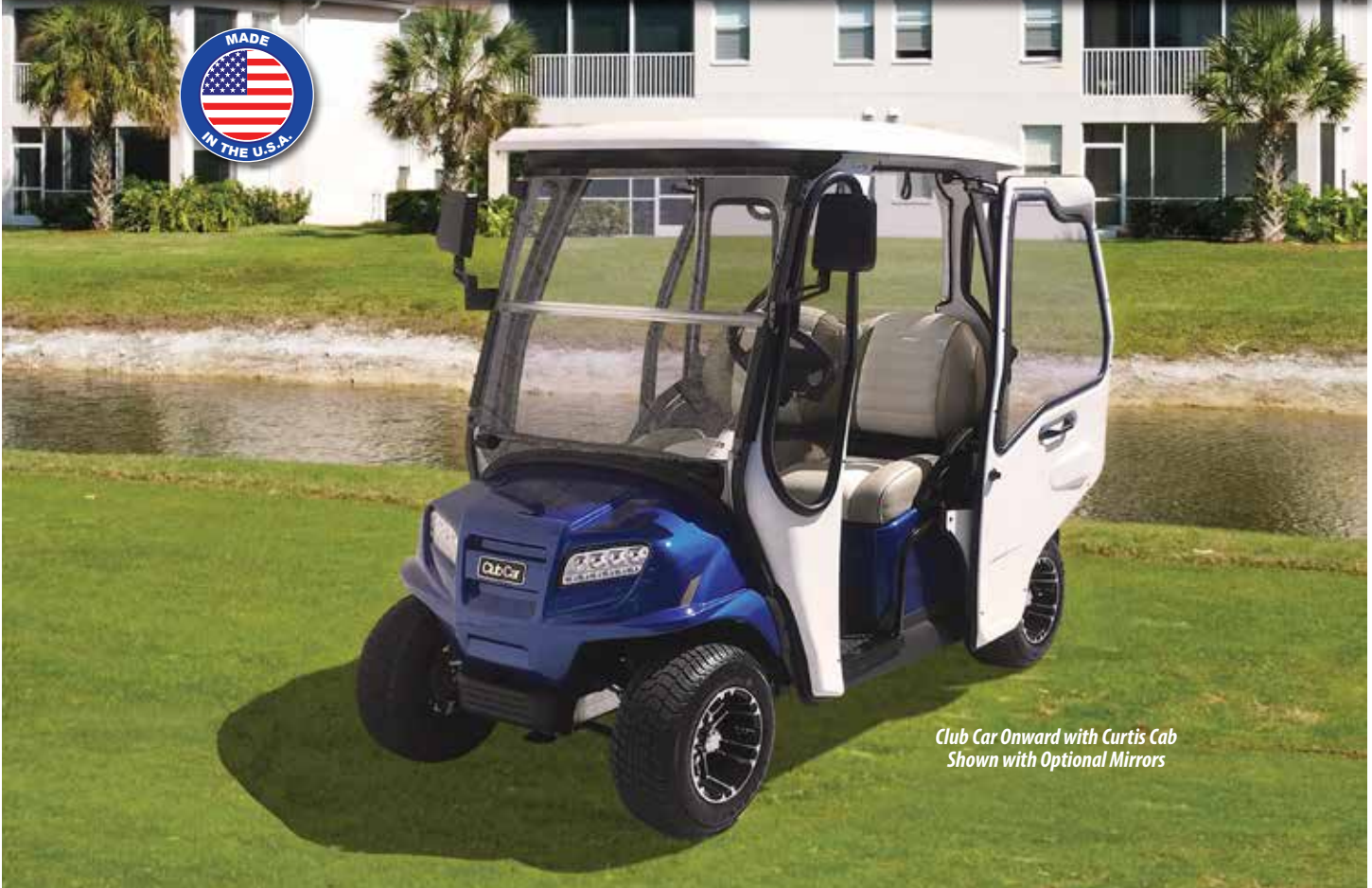
Club Car Onward with Curtis Cab Shown with Optional Mirrors