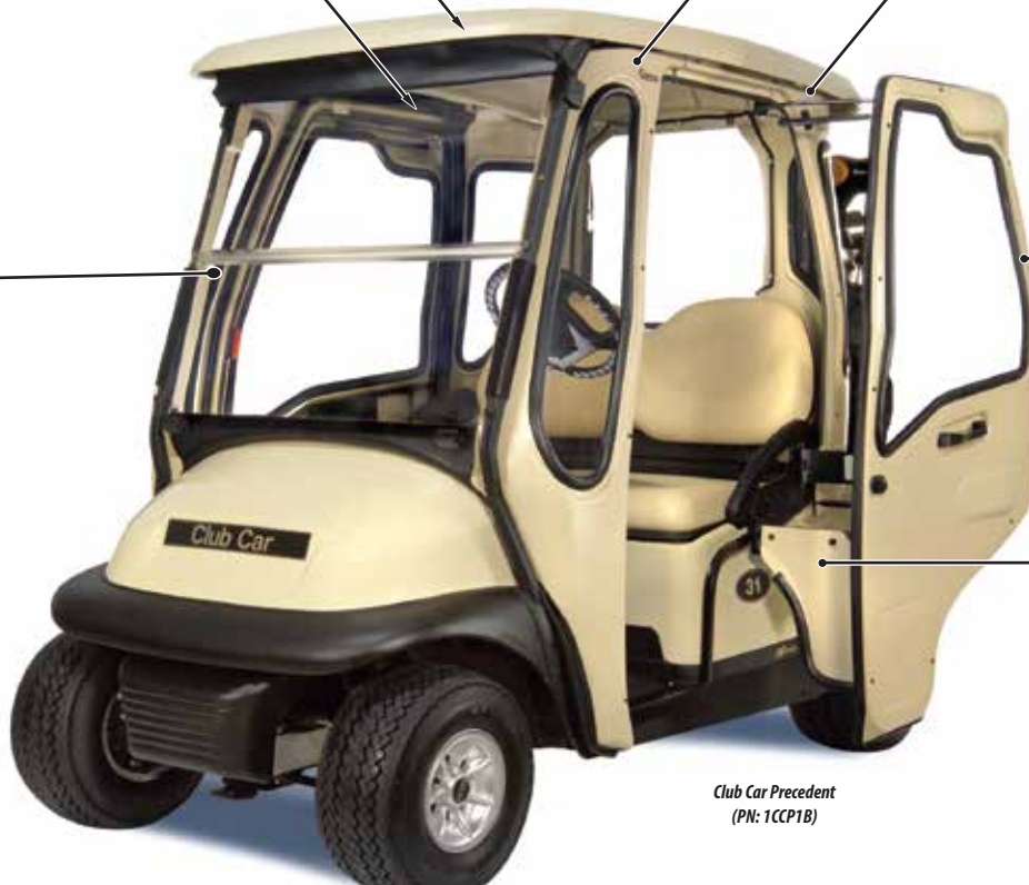
Club Car Precedent (PN: 1CCP1B)

Unique Curtis Hinge Engineered for Parallel Opening Doors