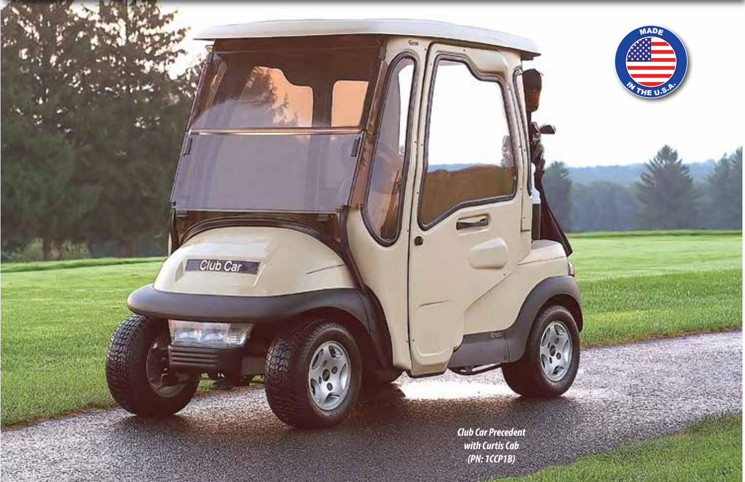
Club Car Precedent with Curtis Cab (PN: 1CCP1B)