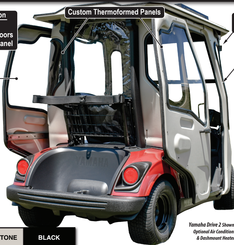
Yamaha Drive 2 Shown with Optional Air Conditioning & Dashmount Heaters

Unique Curtis Glide N' Ride Parallel Opening Doors