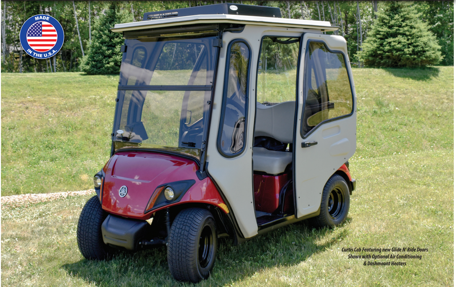
Curtis Cab Featuring new Glide N' Ride Doors Shown with Optional Air Conditioning & Dashmount Heaters