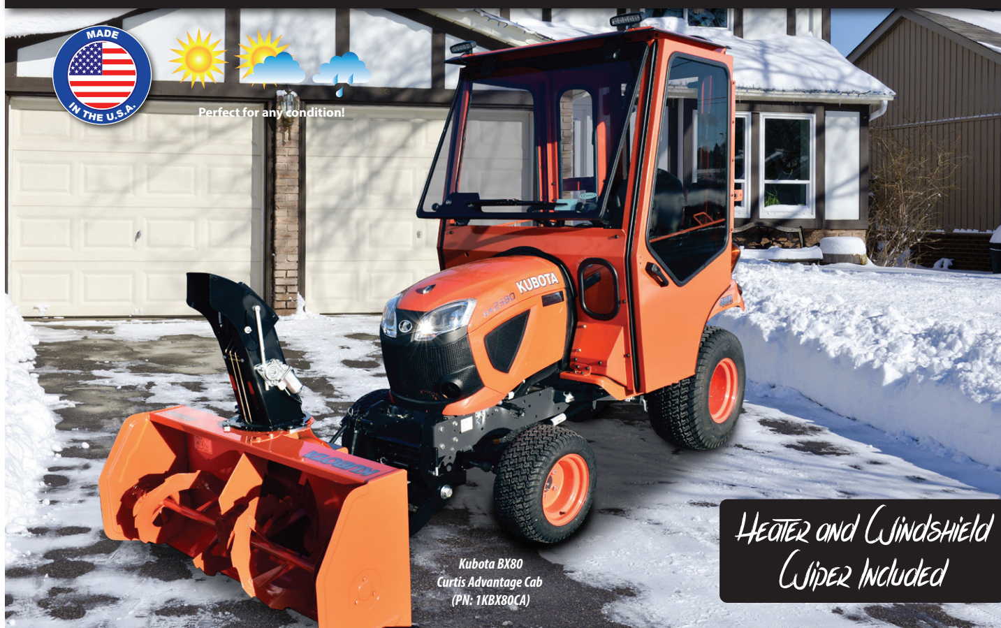
Kubota BX80 Curtis Advantage Cab (PN: 1KBX80CA)