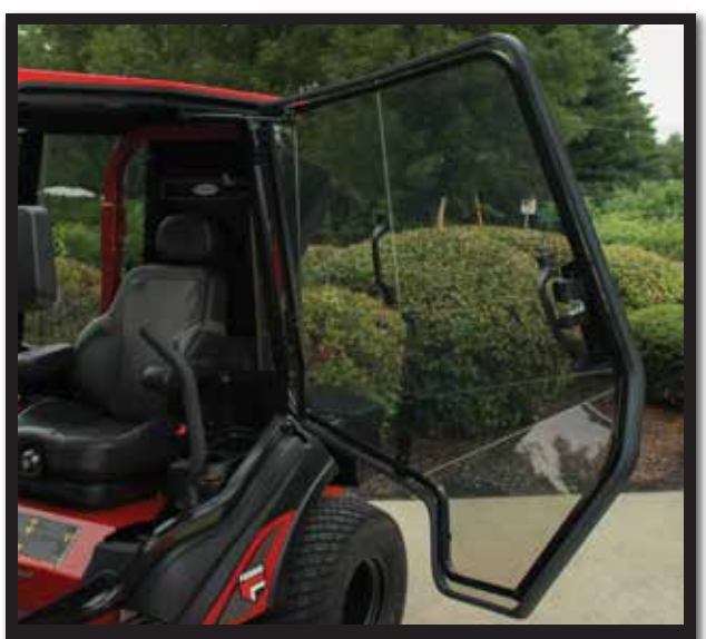
Effortless entry with large, rear-hinged, lockable side doors that may be quickly removed.

Enhancing our Customers' Comfort and Productivity Every Day CURTISS More Innovation. More Value.