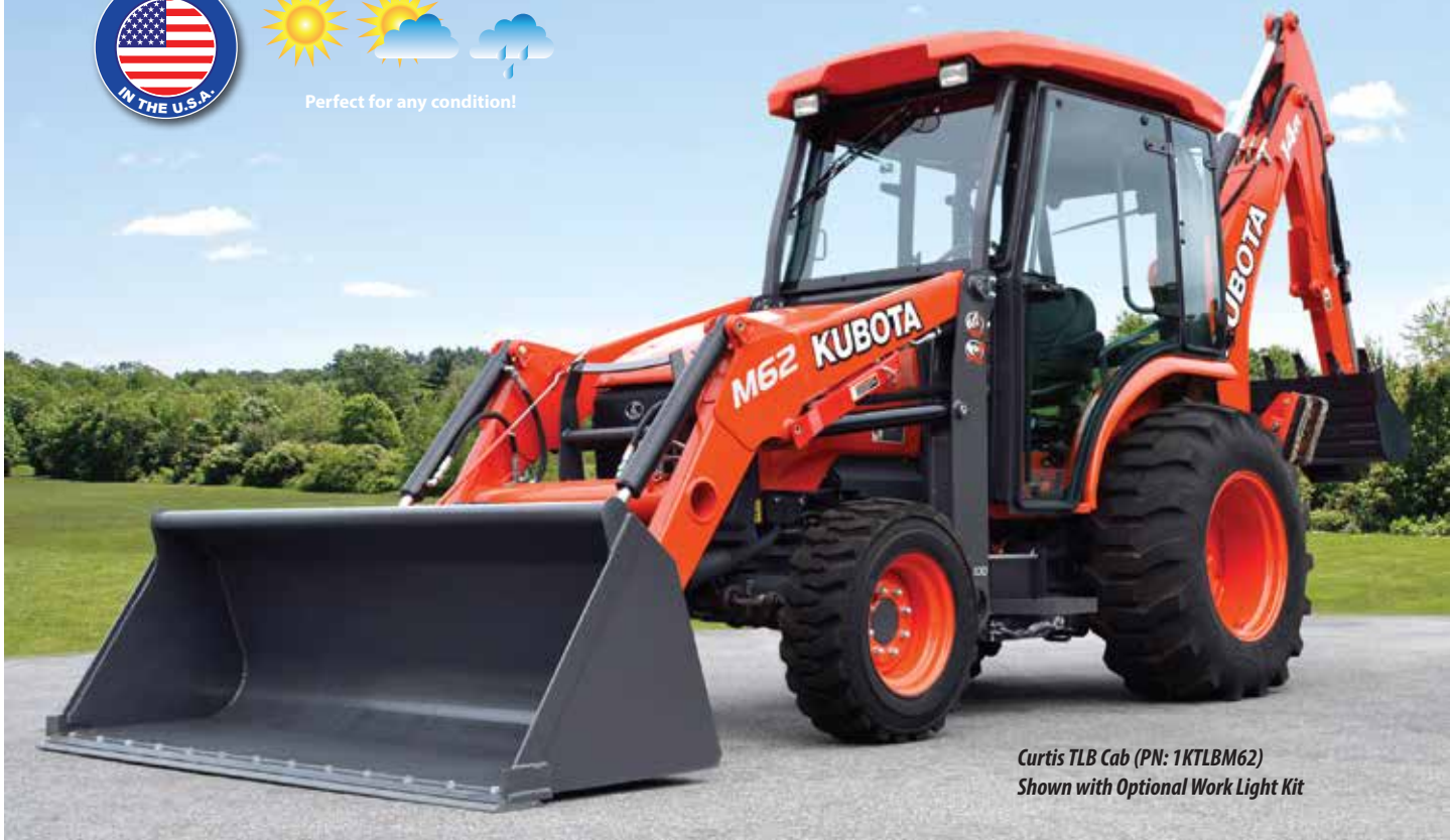
Curtis TLB Cab (PN: 1KTLBM62) Shown with Optional Work Light Kit