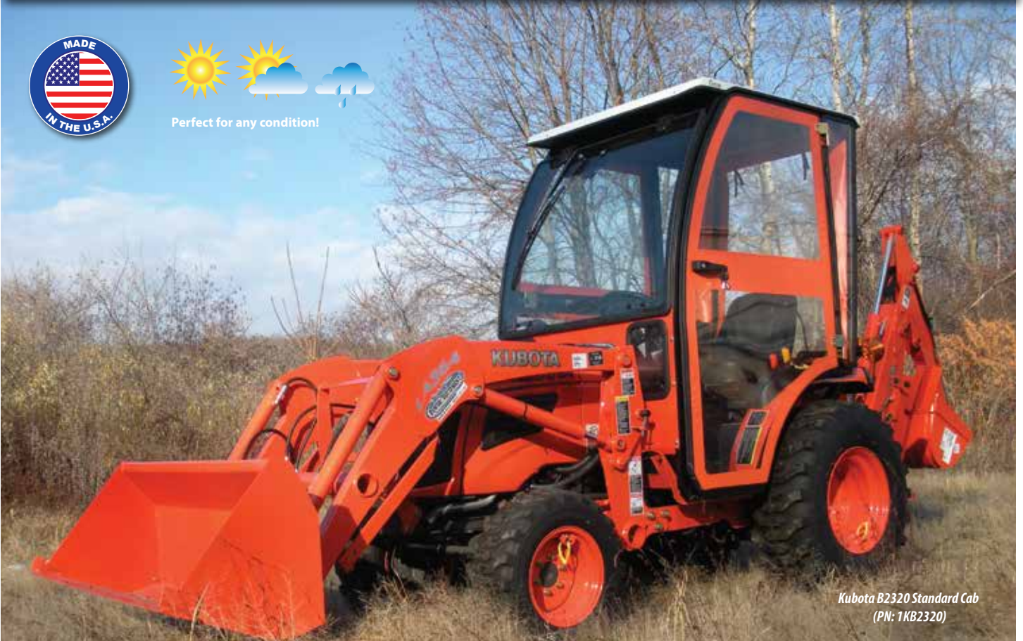
Kubota B2320 Standard Cab (PN: 1KB2320)