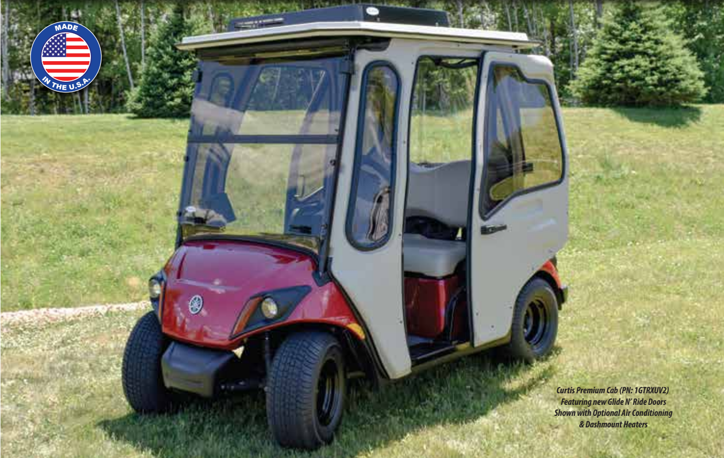
Curtis Premium Cab (PN: 1GTRXUV2) Featuring new Glide N' Ride Doors Shown with Optional Air Conditioning & Dashmount Heaters