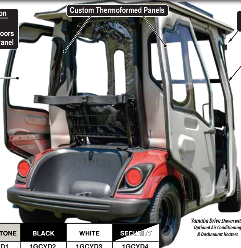
Yamaha Drive Shown with Optional Air Conditioning & Dashmount Heaters

Unique Curtis Glide N' Ride Parallel Opening Doors