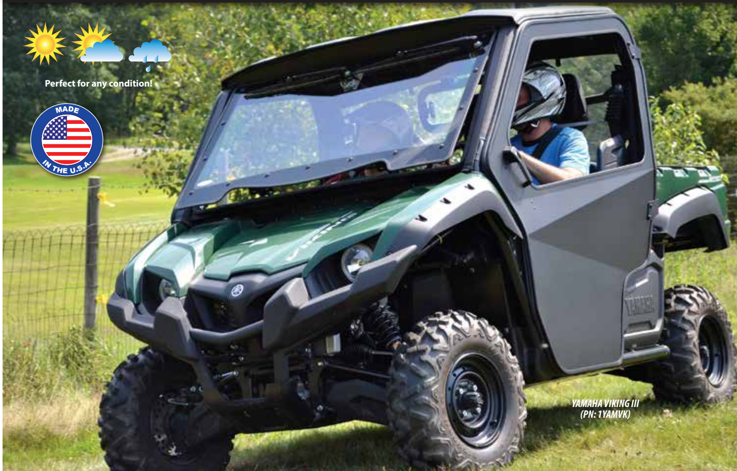
YAMAHA VIKING III (PN: 1YAMVK)