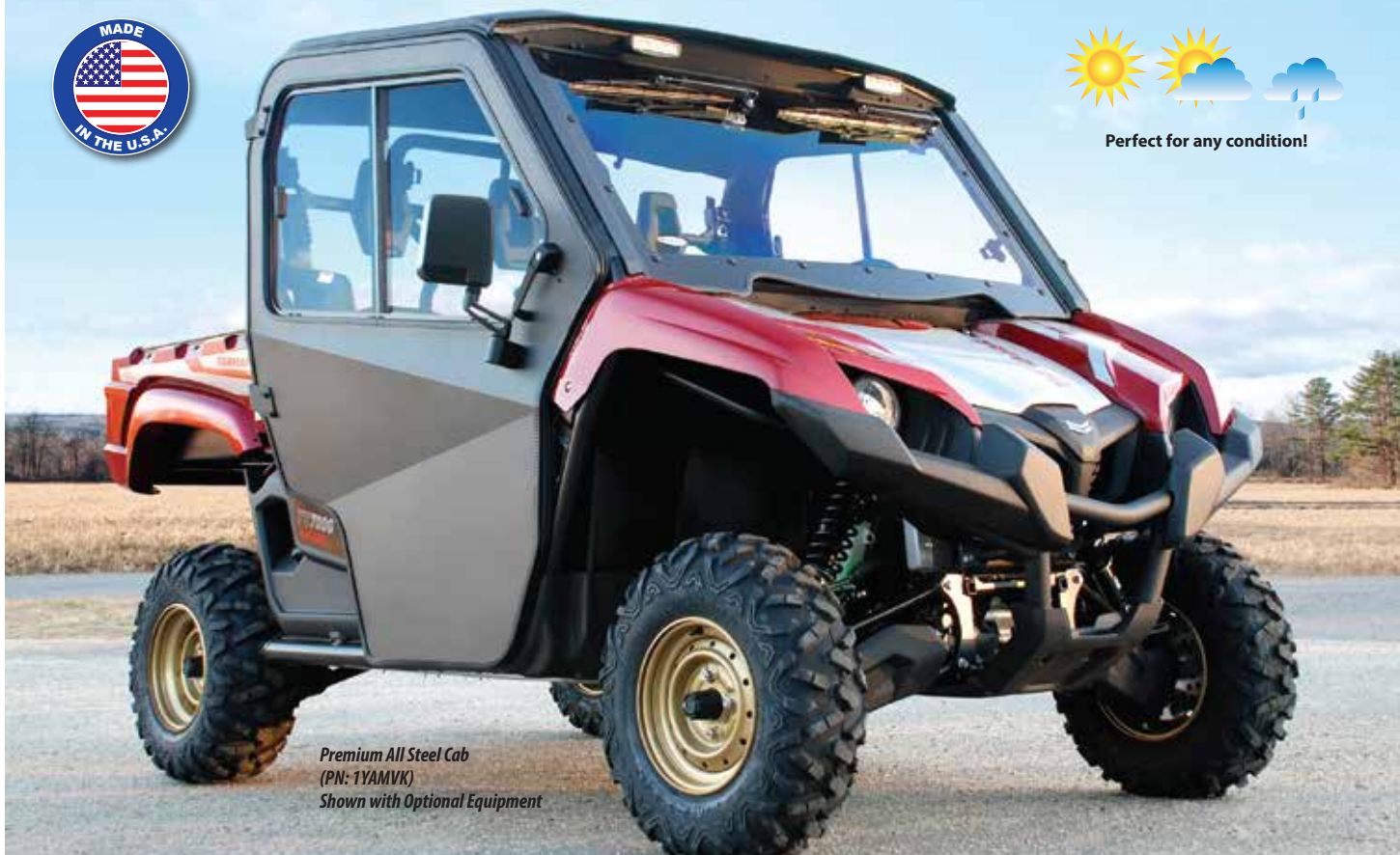
Premium All Steel Cab (PN: 1YAMVK) Shown with Optional Equipment

Ideal cab for the high performance Yanmar Bull UTV