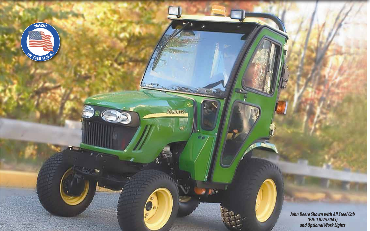
John Deere Shown with All Steel Cab (PN: 1JD2520AS) and Optional Work Lights