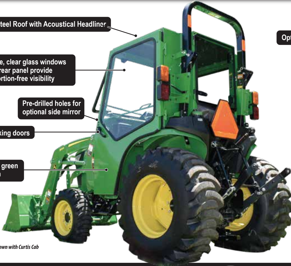
John Deere 3E shown with Curtis Cab (PN: 1JD3ECA)