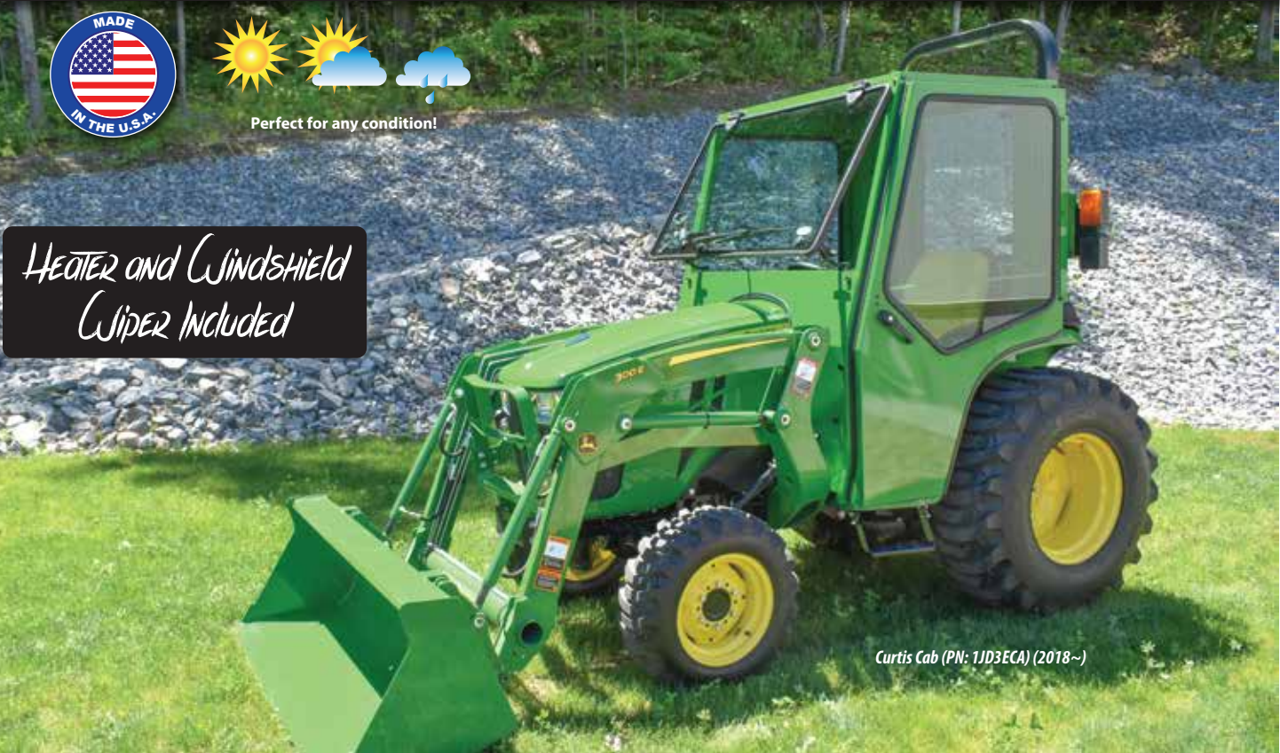
Curtis Cab (PN: 1JD3ECA) (2018~)

Fully Compatible With 2018 John Deere 3025E, 3032E & 3038E Tractors