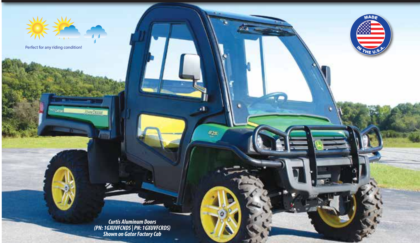
Curtis Aluminum Doors (PN: 1GXUVFCNDS | PN: 1GXUVFCRDS) Shown on Gator Factory Cab

A Great Investment Whether Replacing A Broken Factory Door or Buying New Fits 2004+ 620i, 625i, 825i, 850D & 855D Gators with a #4004 Deluxe Cab Frame