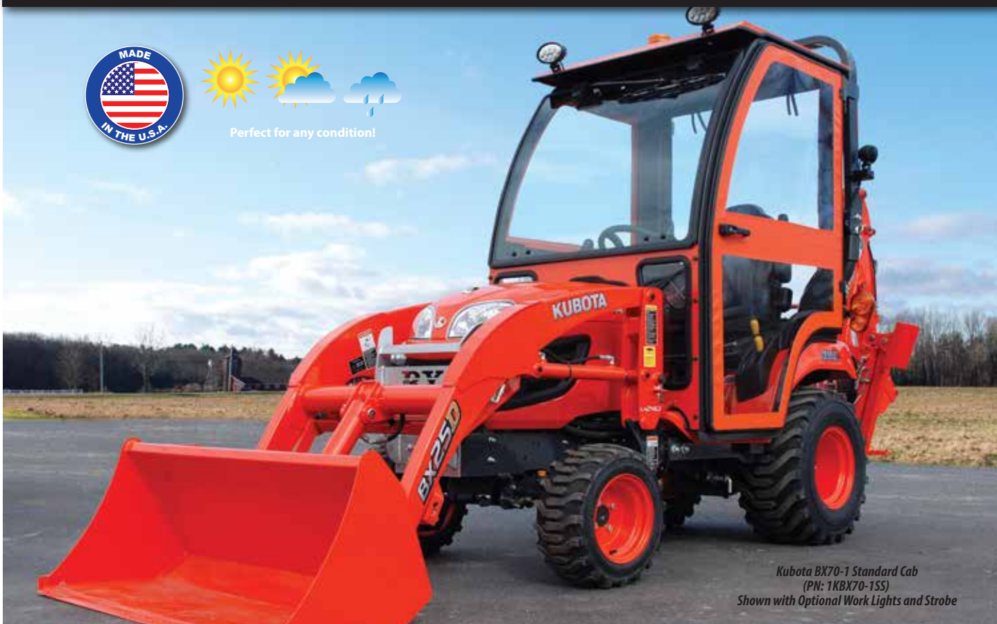
Kubota BX70-1 Standard Cab (PN: 1KBX70-1SS) Shown with Optional Work Lights and Strobe

Cab System Fits Kubota BX2370-1 and BX2670-1 Compact Tractors