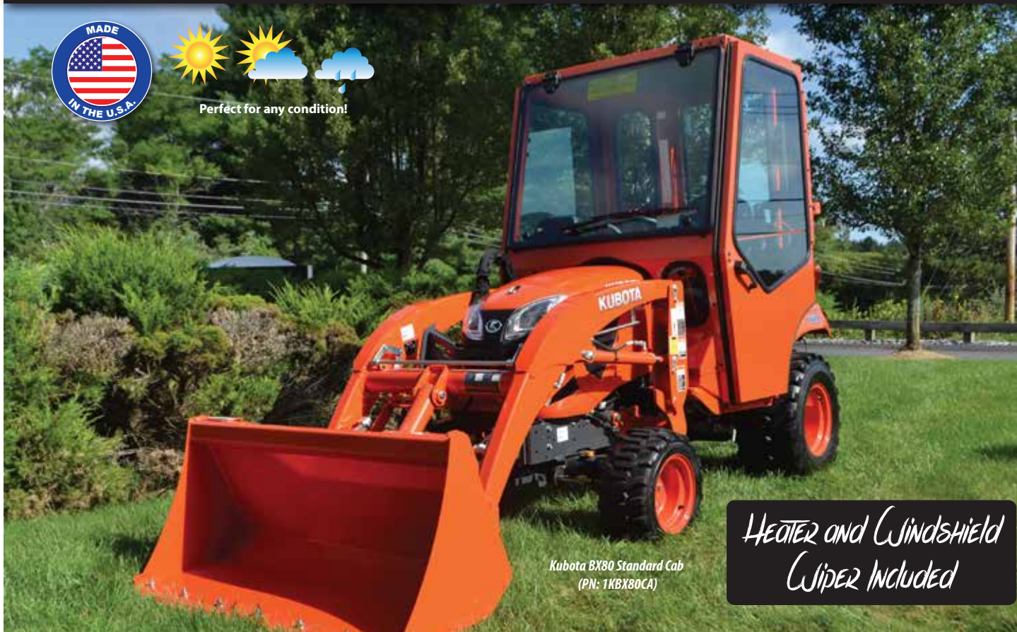
Kubota BX80 Standard Cab (PN: 1KBX80CA)