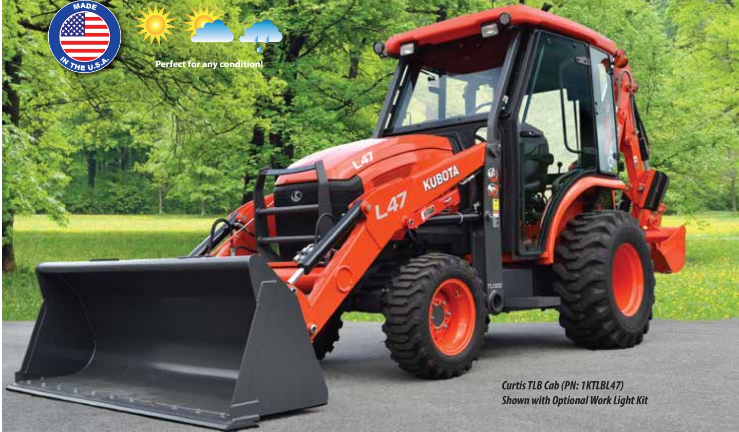
Curtis TLB Cab (PN: 1KTLBL47) Shown with Optional Work Light Kit