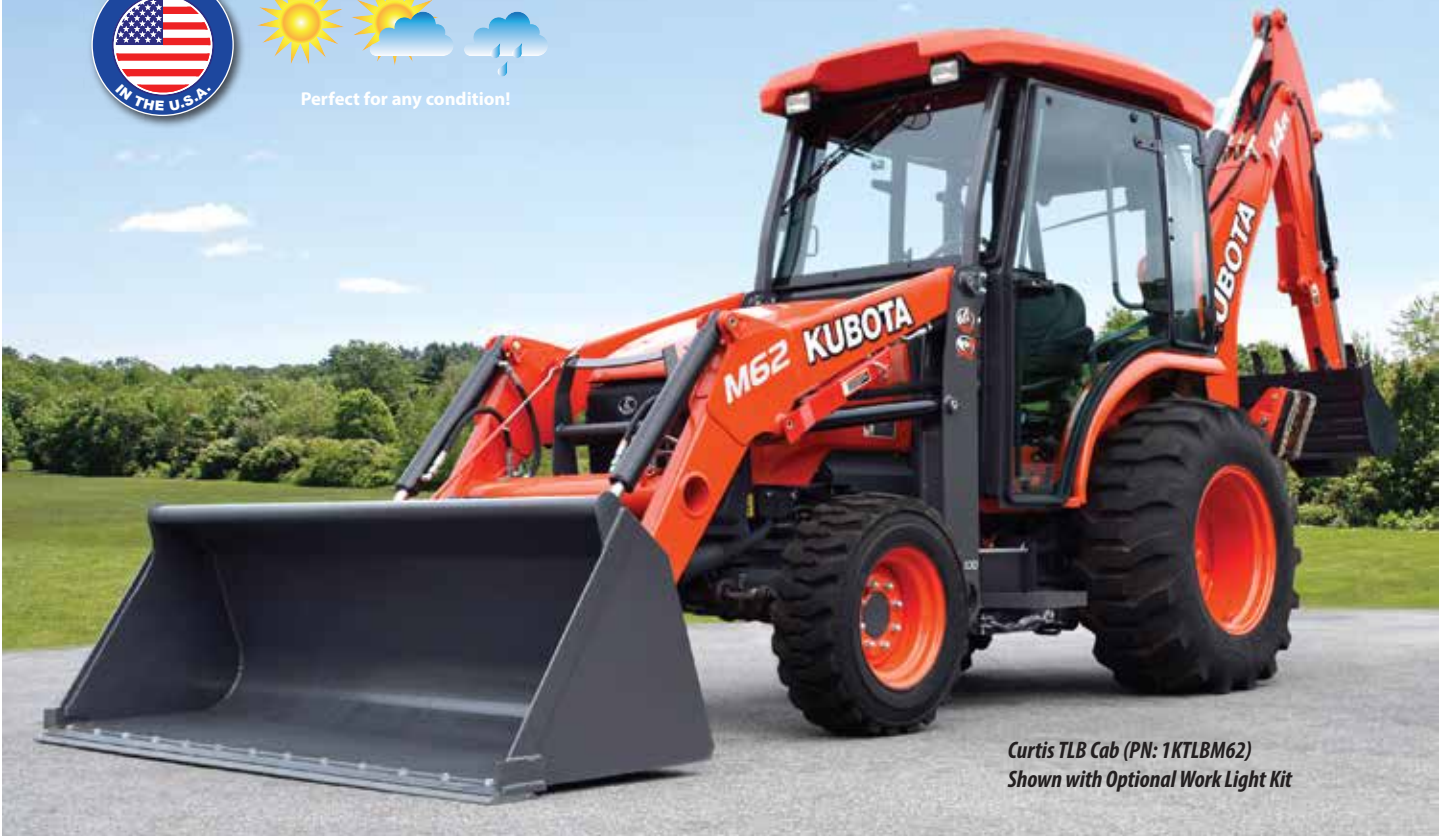
Curtis TLB Cab (PN: 1KTLBM62) Shown with Optional Work Light Kit