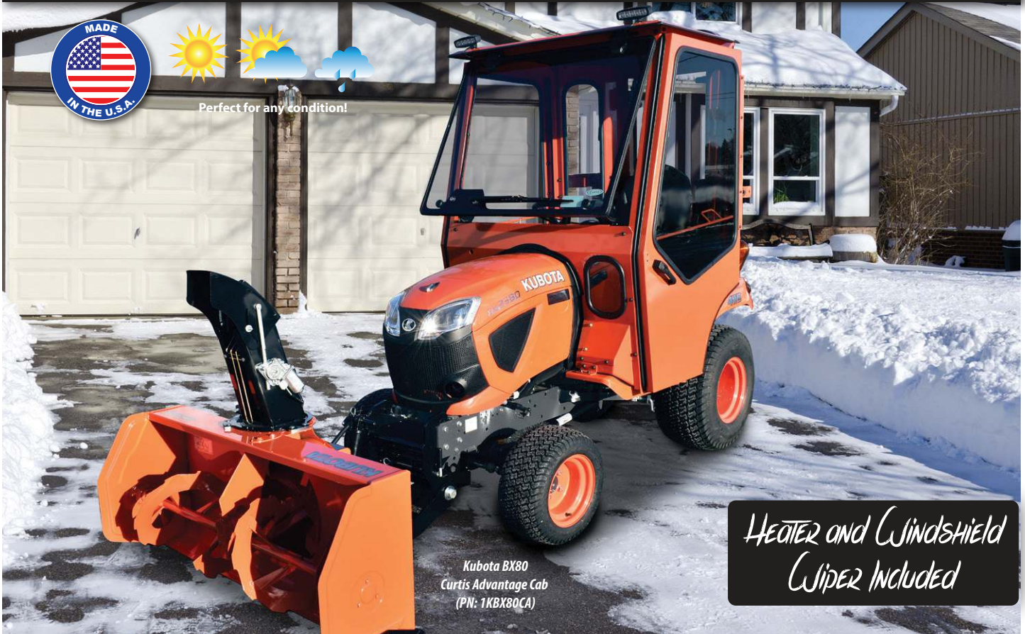
Kubota BX80 Curtis Advantage Cab (PN: 1KBX80CA)