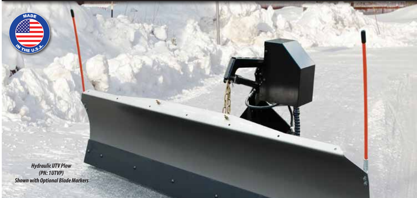
Hydraulic UTV Plow (PN: 1UTVP) Shown with Optional Blade Markers

Custom Mounts for: John Deere Gator XUV 835 & 865 John Deere Gator XUV 615, 625, 815, 825, 855: 2011+ Polaris Ranger XP900: 2013+ | Club Car XRT1551 Kawasaki Mule Pro FX/DX, Pro FXT/DXT