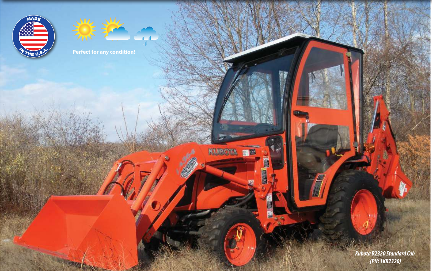
Kubota B2320 Standard Cab (PN: 1KB2320)