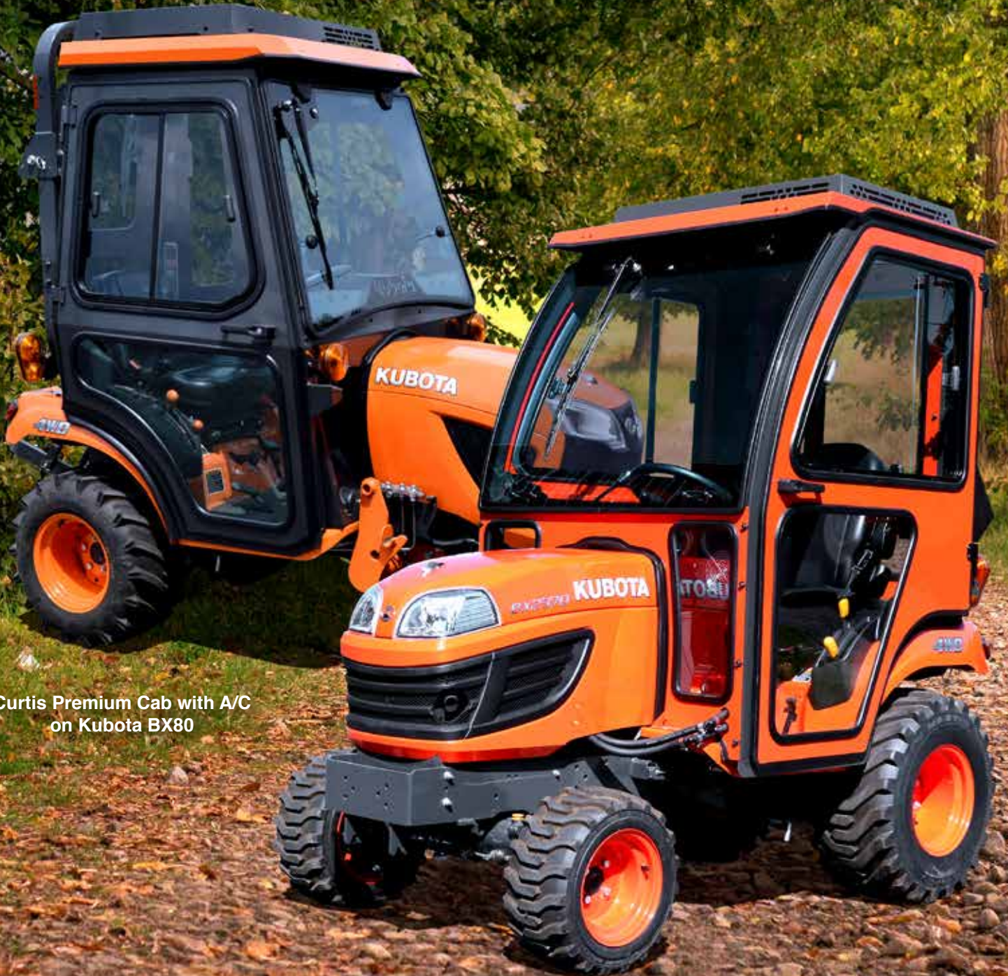
Curtis Premium Cab with A/C on Kubota BX80