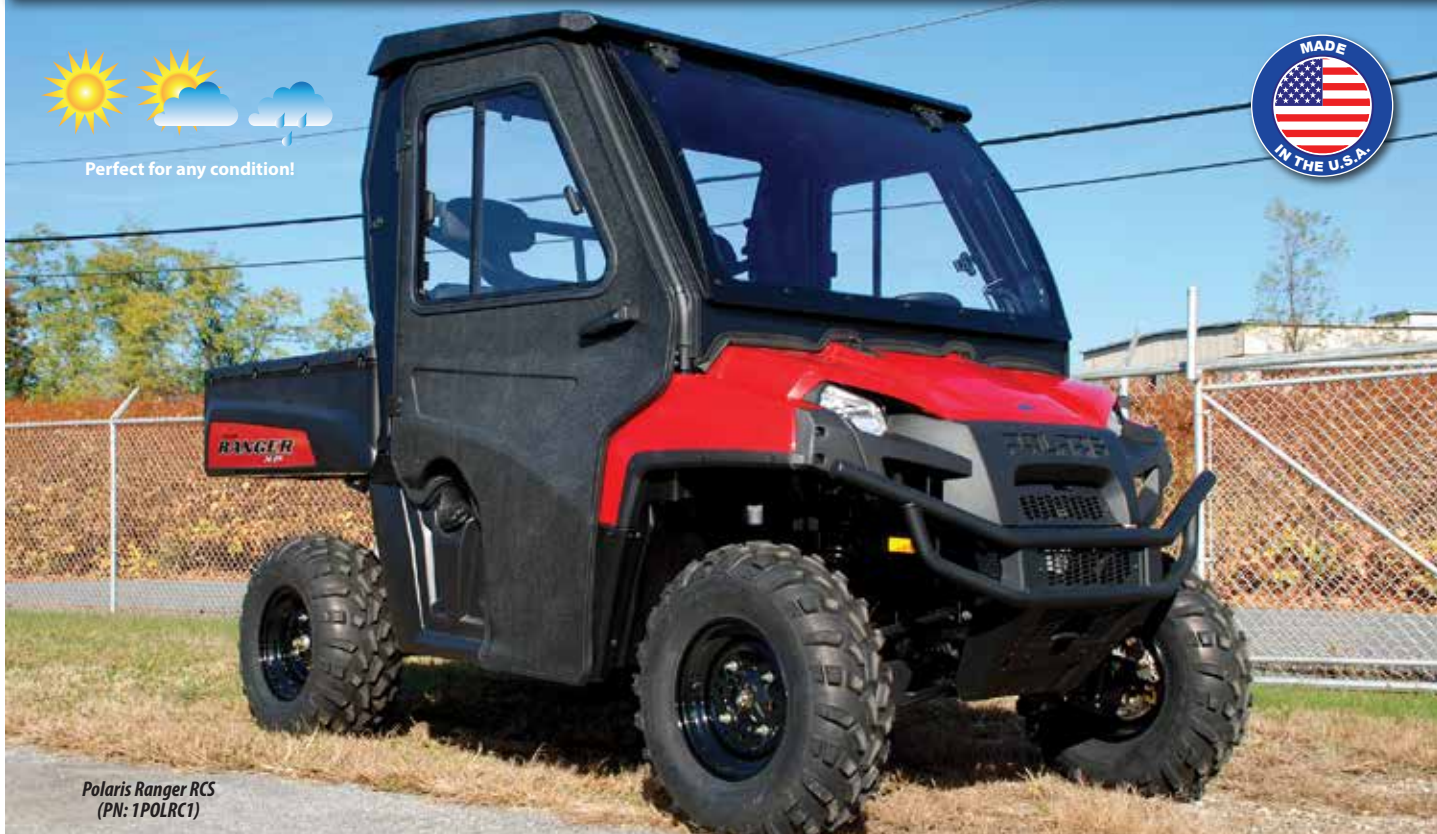
Polaris Ranger RCS (PN: 1POLRC1)