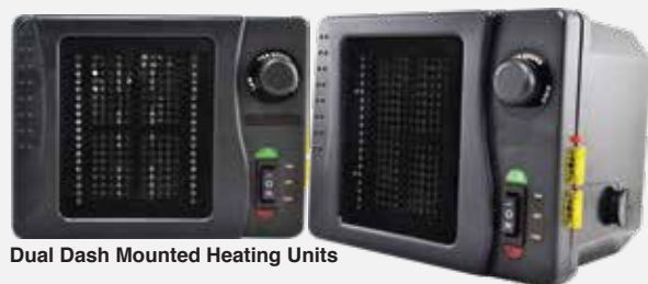
Dual Dash Mounted Heating Units

* System works with Curtis & other select cabs – See your local dealer for more info