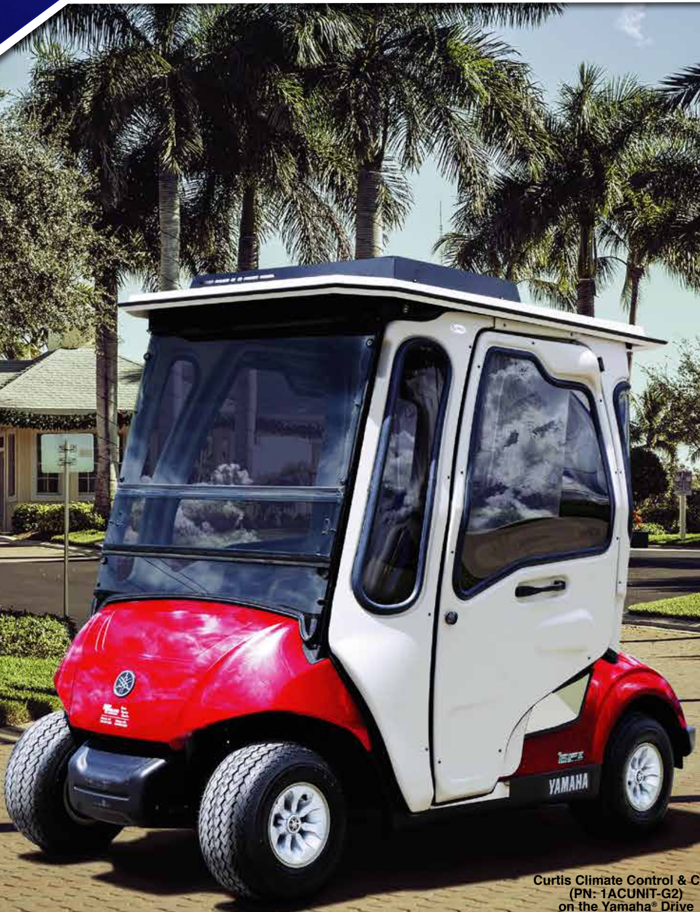
Curtis Climate Control & Cab (PN: 1ACUNIT-G2) on the Yamaha® Drive