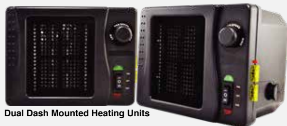
Dual Dash Mounted Heating Units

* System works with Curtis & other select cabs – See your local dealer for more info