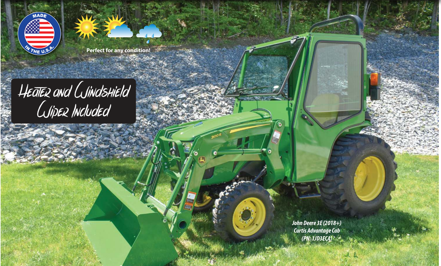
John Deere 3E (2018+) Curtis Advantage Cab (PN: 1JD3ECA)

Cab Fits John Deere 3025E, 3032E & 3038E Models 2018+