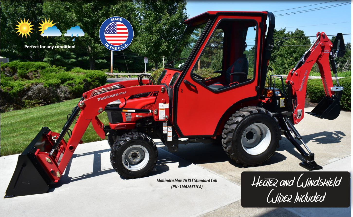
Mahindra Max 26 XLT Standard Cab (PN: 1MA26XLTCA)