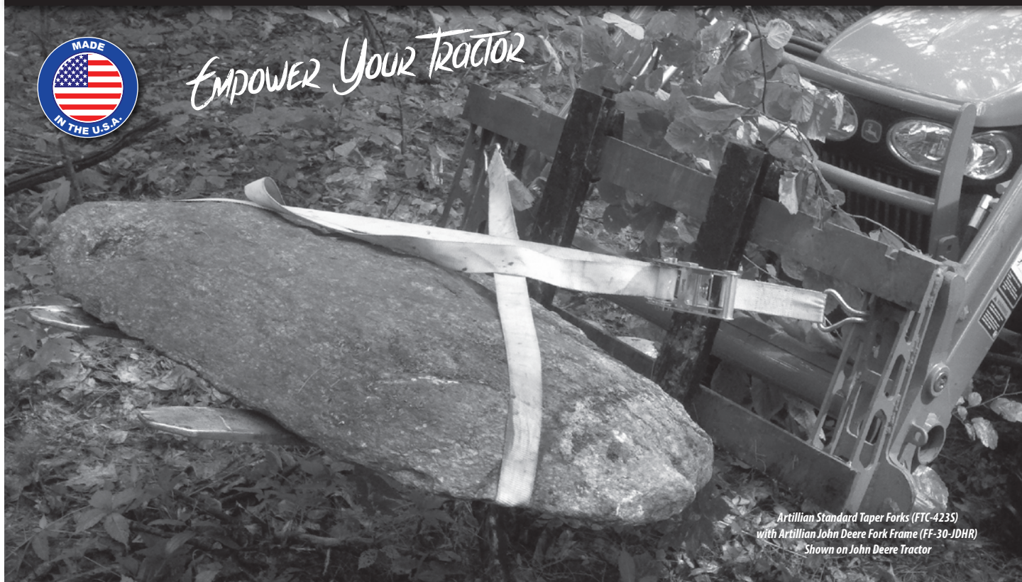
Artillian Standard Taper Forks (FTC-423S) with Artillian John Deere Fork Frame (FF-30-JDHR) Shown on John Deere Tractor

Compatible with John Deere and Skid Steer Quick Attach Loaders (Kubota, Mahindra, Massey Ferguson & Yanmar)