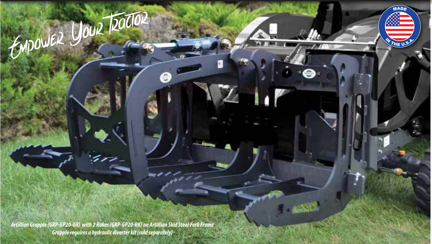
Artillian Grapple (GRP-GP20-GR) with 2 Rakes (GRP-GP20-RK) on Artillian Skid Steer Fork Frame Grapple requires a hydraulic diverter kit (sold separately)

Artillian's modular design lets you mix-&-match sections to fit your needs.