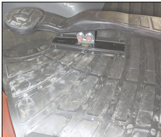
Figure 5.2 (Install Outer Drive Pedal Brush)