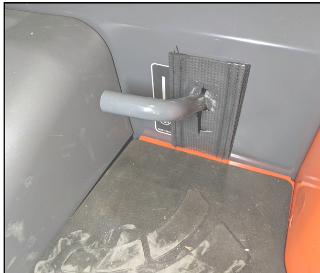
Figure 1.2 (Differential Lock Lever Seal)