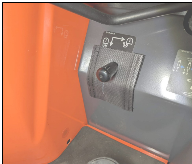
Figure 2.2 (Loader Control Lock Lever Filler)