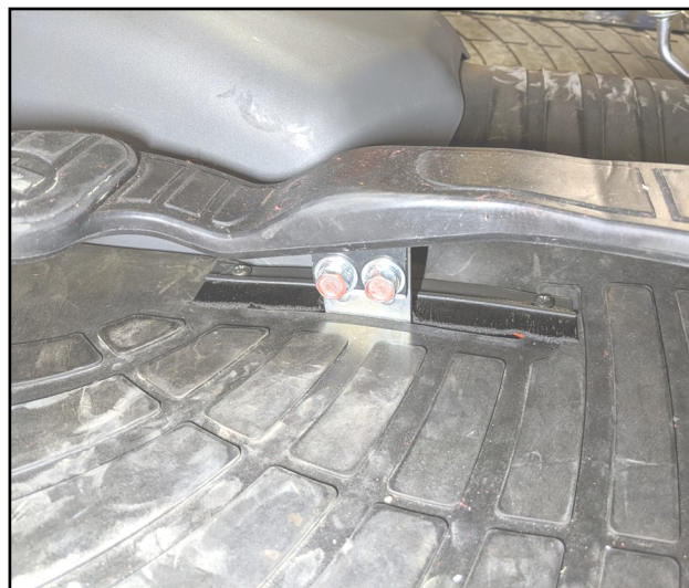
Figure 5.1 (Install Inner Drive Pedal Brush)