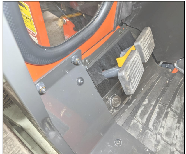
Figure 4.2 (Install Top Brake Pedal Brush)