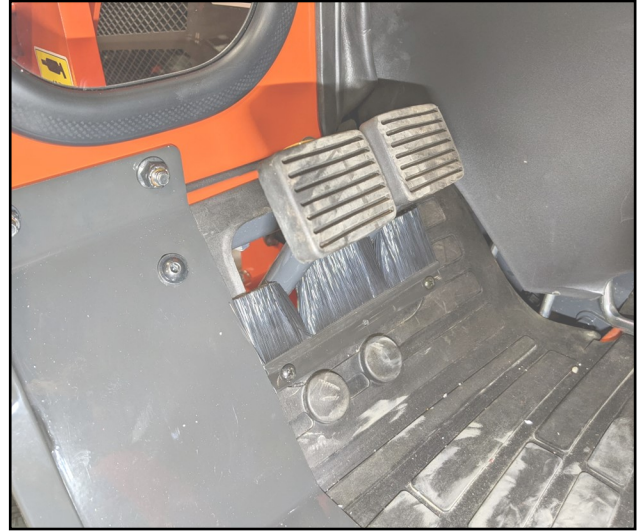
Figure 4.1 (Install Bottom Brake Pedal Brush)