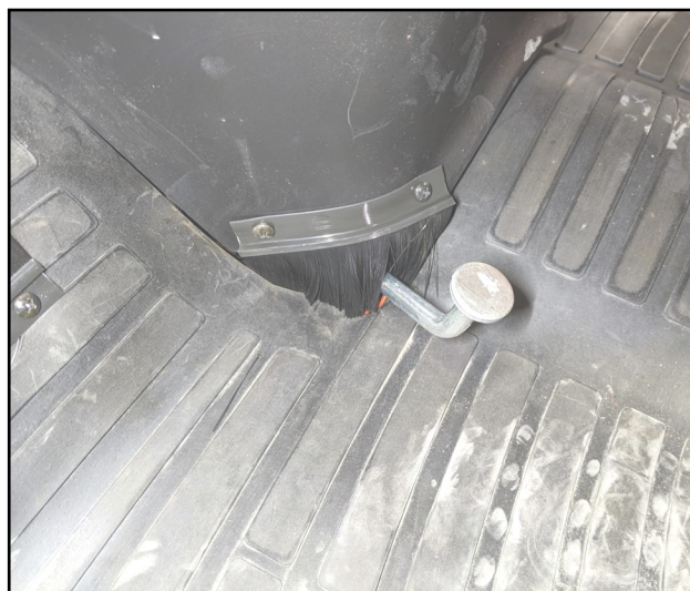
Figure 3.1 (Steering Wheel Angle Brush)